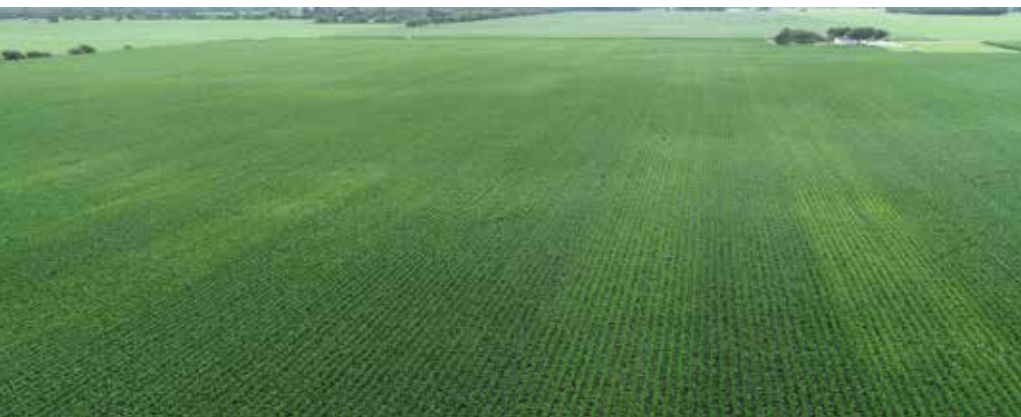
Shelby county sulfur (S) response trial in 2018. 16-row strips of light green corn can be seen where no S was applied to the corn crop. Where S was applied, the corn has a darker green color.